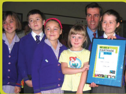
MP Andrew Selous at Fairtrade School, Heathwood Lower

If you think you can volunteer to help we would be pleased to hear from you. Visit our website: www.fairtradell.co.uk Site design by GS Studios with thanks