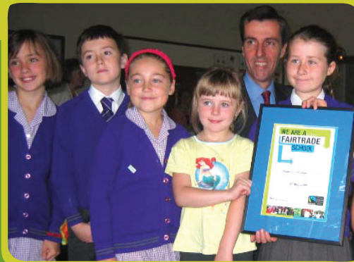
MP Andrew Selous at Fairtrade School, Heathwood Lower

The Fairtrade Foundation only awards the Mark to products that have met rigorous internationally agreed Fairtrade Standards. www.fairtrade.org.uk